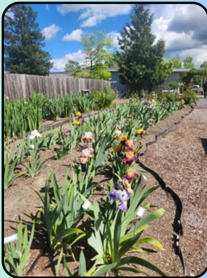
Club display beds at Luther Burbank Art & Garden Center, 2024