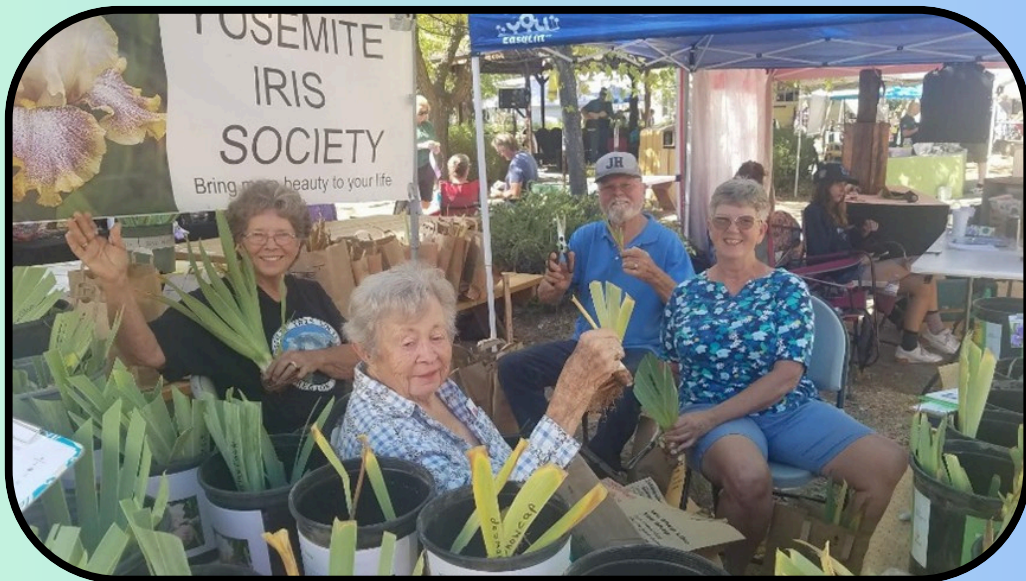
YIS Members @ Farmer's Market Fundraiser.