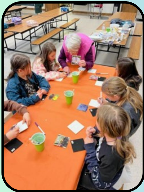
Wasuma School AIS Youths making Iris Coasters.

The CIP's meet once a month in the school gardens and cafeteria. We have a lesson plan for each month of the school year. We have planted an iris garden, learned about the color patterns of irises, parts of iris, hybridizing, reblooming irises, show prep instructions and introduction to the different classes of bearded irises. In January, students did an iris craft project of making an "iris" coaster by gluing an iris picture onto a 3 in x 3 in. tile.