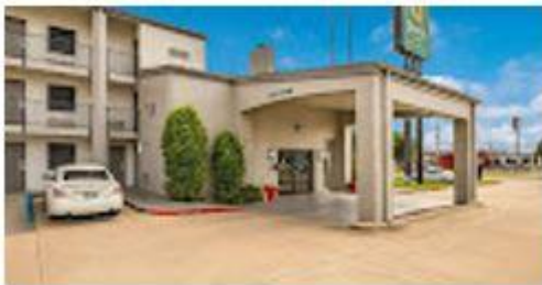
Best Western Village Inn, Fresno, CA 3110 N. Blackstone Av. Fresno, CA Call: (888)306-3991 $96 /night