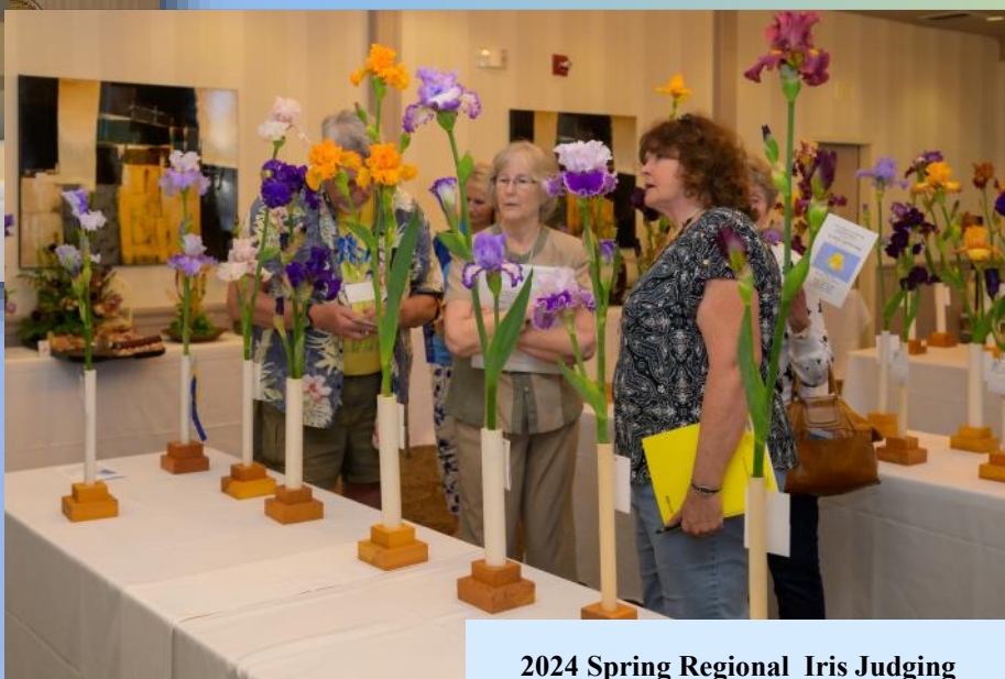
2024 Spring Regional Iris Judging