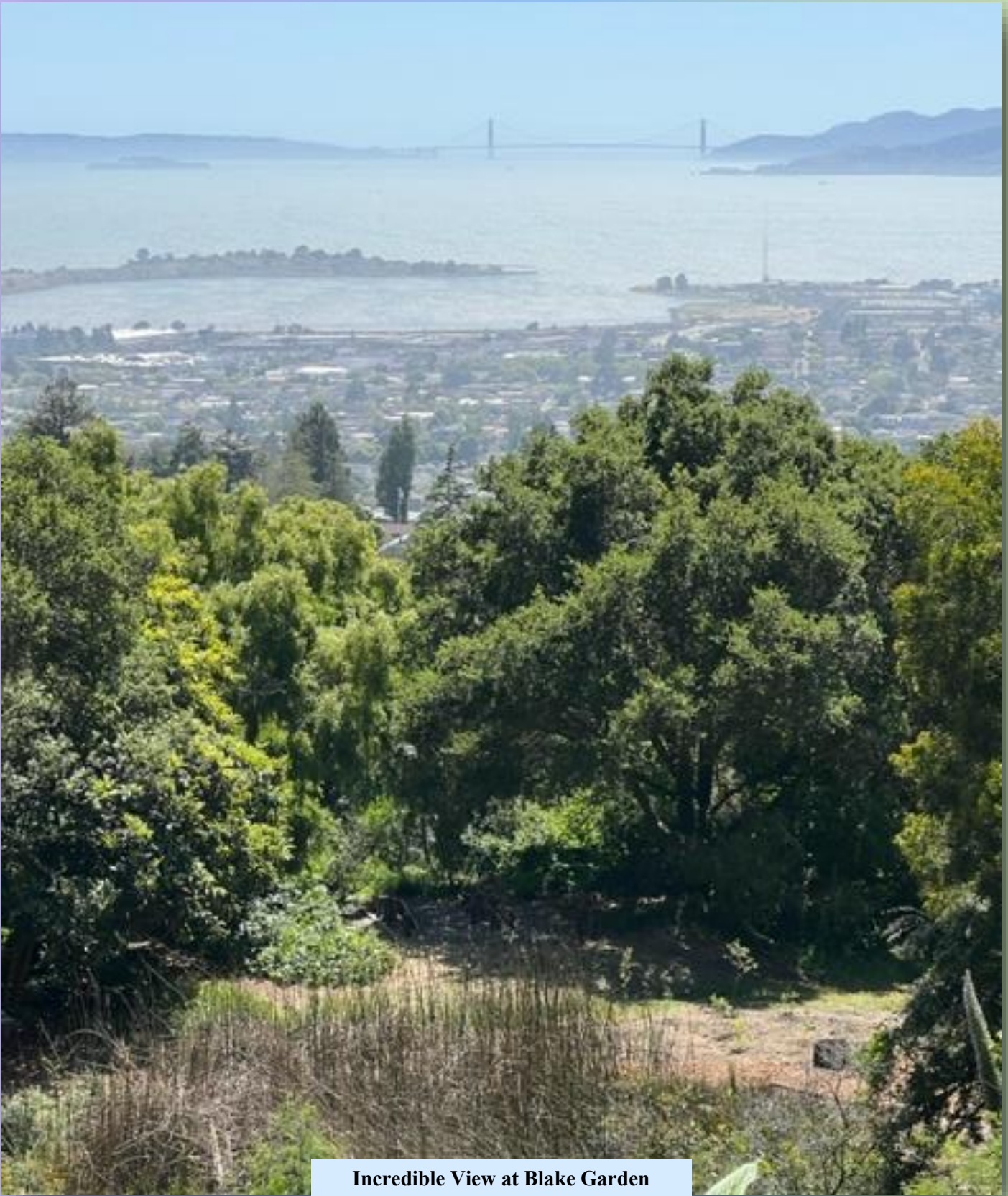
Incredible View at Blake Garden