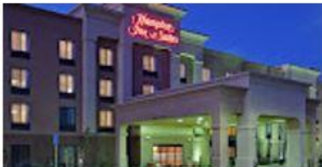
Hampton Inn & Suites, Fresno 327 E. Fir Ave. Fresno, CA Call: (559)527-5219 $160/night