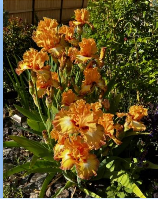
TB 'Oil Painting'

Members who do not have access to a computer may ask the Editor for a printed copy at no charge.