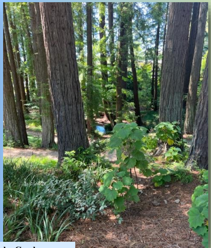
Scenes from Blake Garden