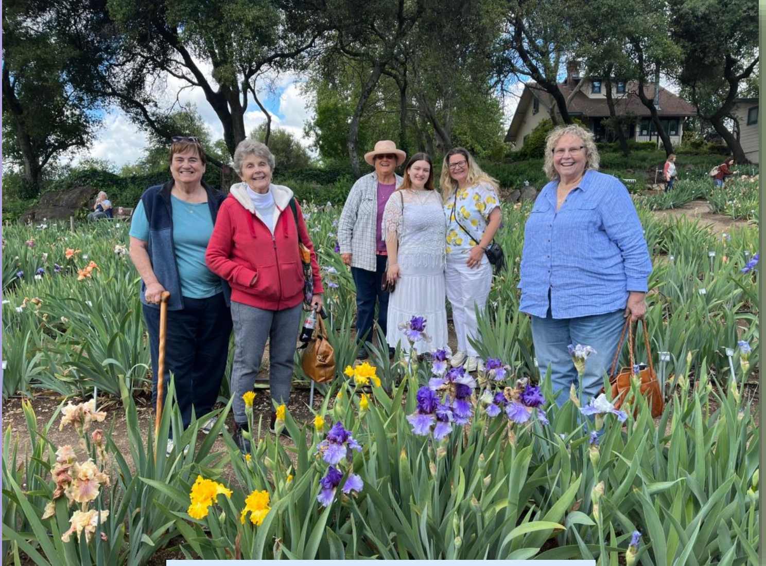
Dedicated Leo T. Clark Members at Horton's Iris Garden

In May, we took a trip to Loomis for a visit to Horton's Iris Garden. Despite the hail that had pounded a lot of the state the night before, it was a beautiful day in a beautiful garden. We had a great time wandering the grounds and viewing the iris, as well as taking advantage of the large amount of potted iris available.