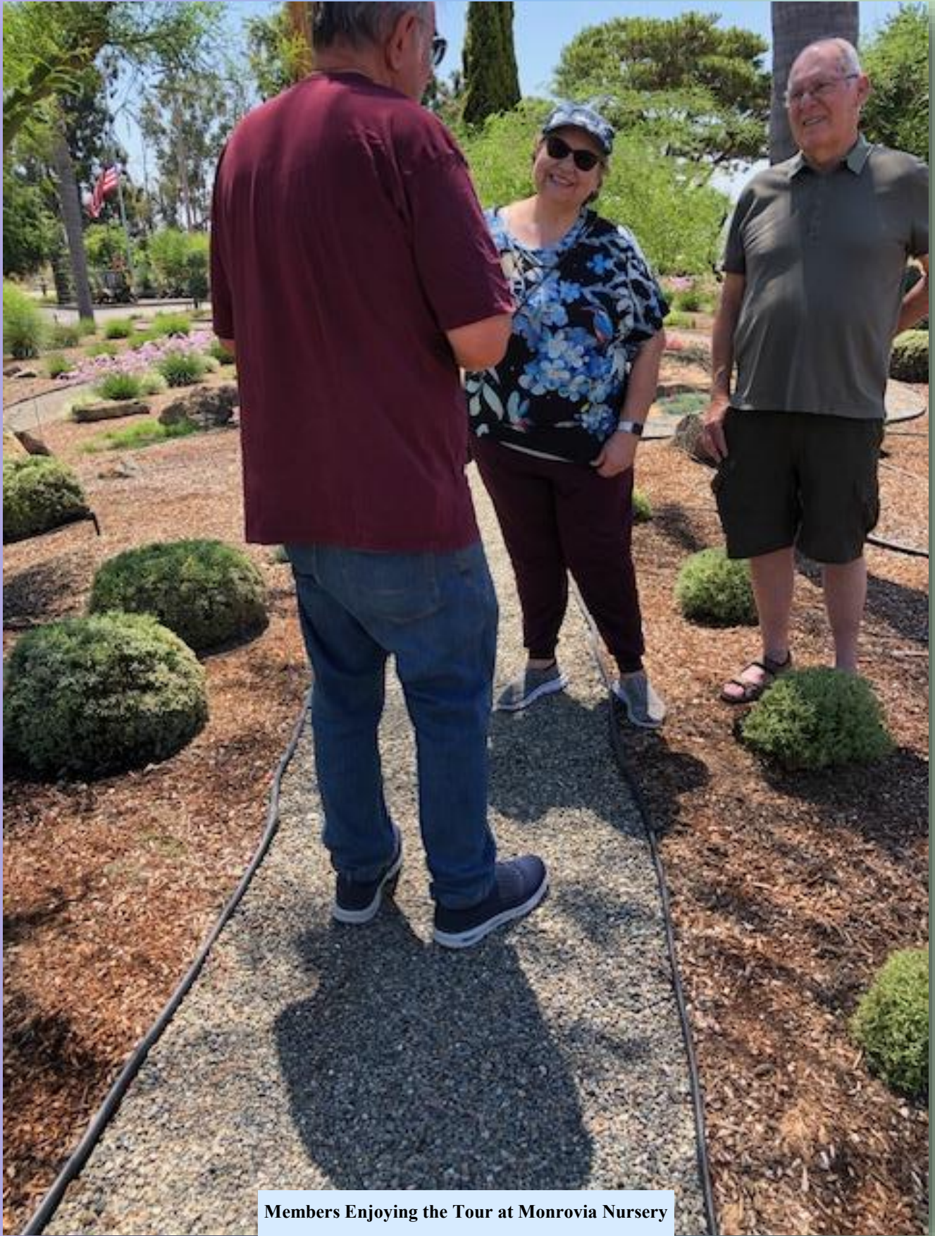
Members Enjoying the Tour at Monrovia Nursery