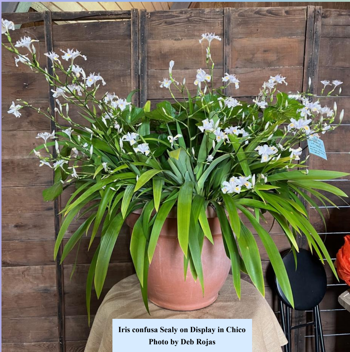
Iris confusa Sealy on Display in Chico

In early April, we set up a booth at the Spring Home and Garden Show at the fairgrounds in Chico. Volunteers from our club had a fine time chatting up the public about the awesome attributes of iris. Also on display was a huge pot of Iris confusa Sealy (Bamboo or Wandering Iris), which was a star attraction.