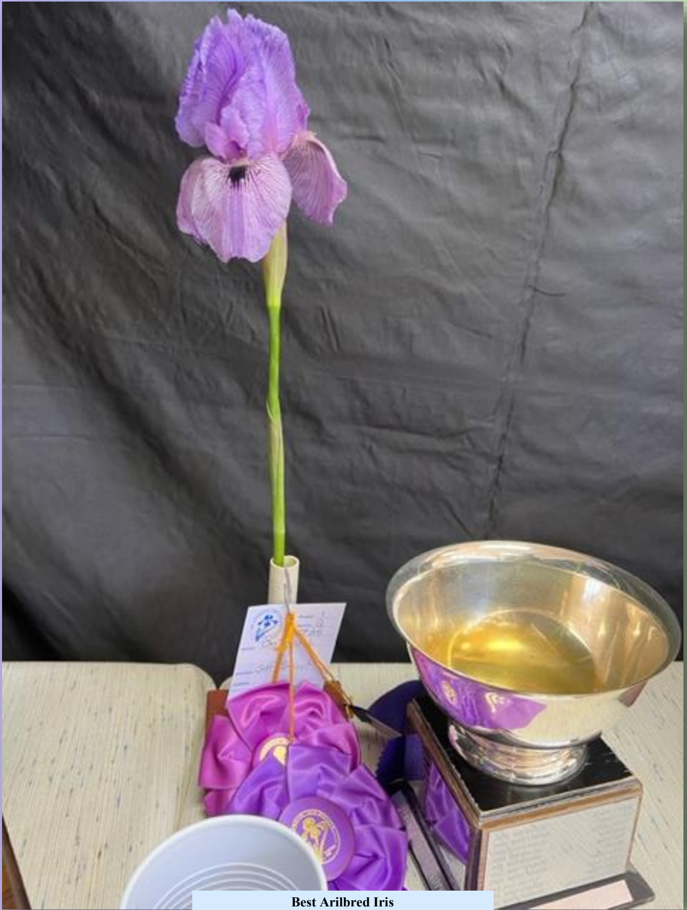
Best Arilbred Iris 'On the Web'