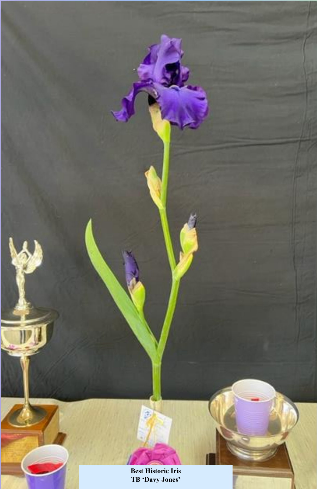
Best Historic Iris TB 'Davy Jones'