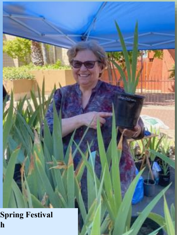
Members Helping at the Porterville Spring Festival