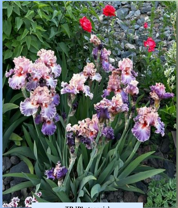
TB 'Photogenic'