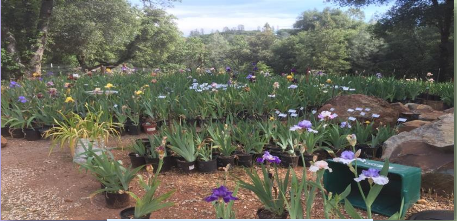
Some of the Club's Potted Iris Growing in Cindy Eastman's Garden

We had our semi-annual potted sale at Weiss Bros nursery in Grass Valley on Friday, May 3 rd . We actually sold out all of our pots on that day. We were scheduled for both May 3 rd and May 4 th . We were thankful to have sold out because it poured rain on Saturday the 4 th !