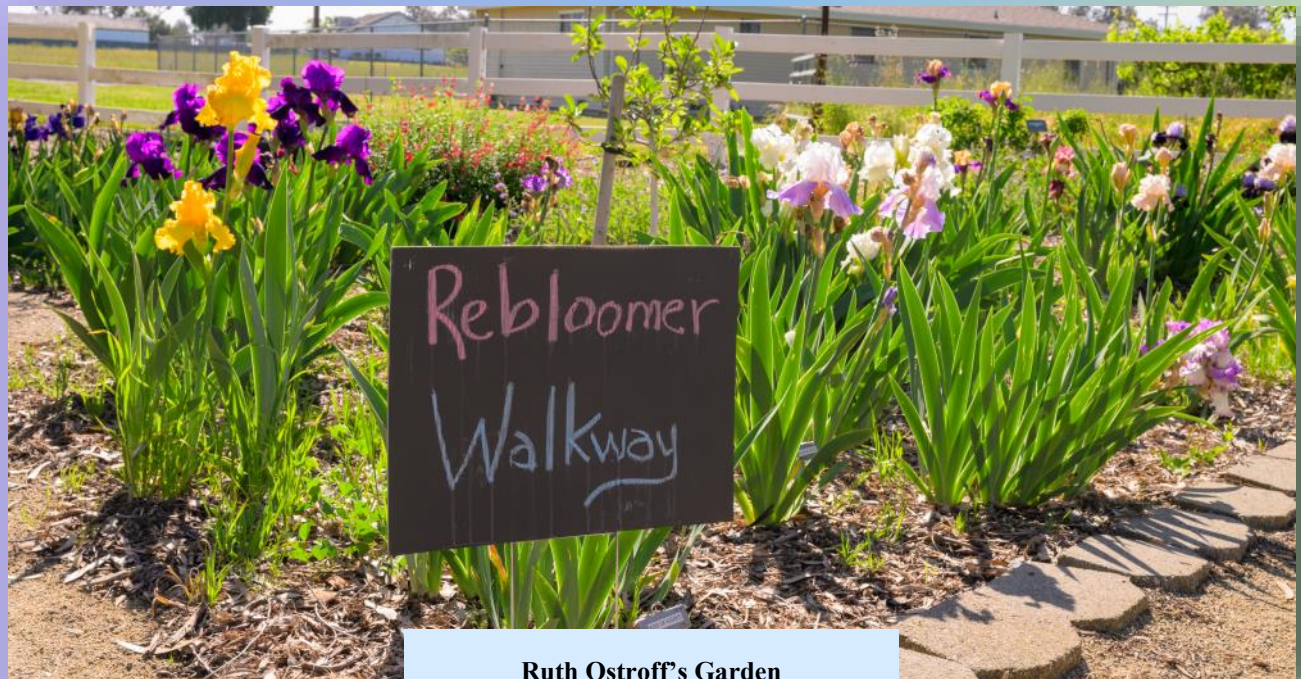
Ruth Ostroff's Garden