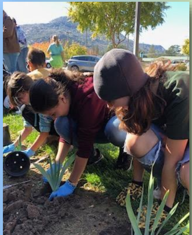
5th Grade Students Planting Irises Oakhurst Elementary School