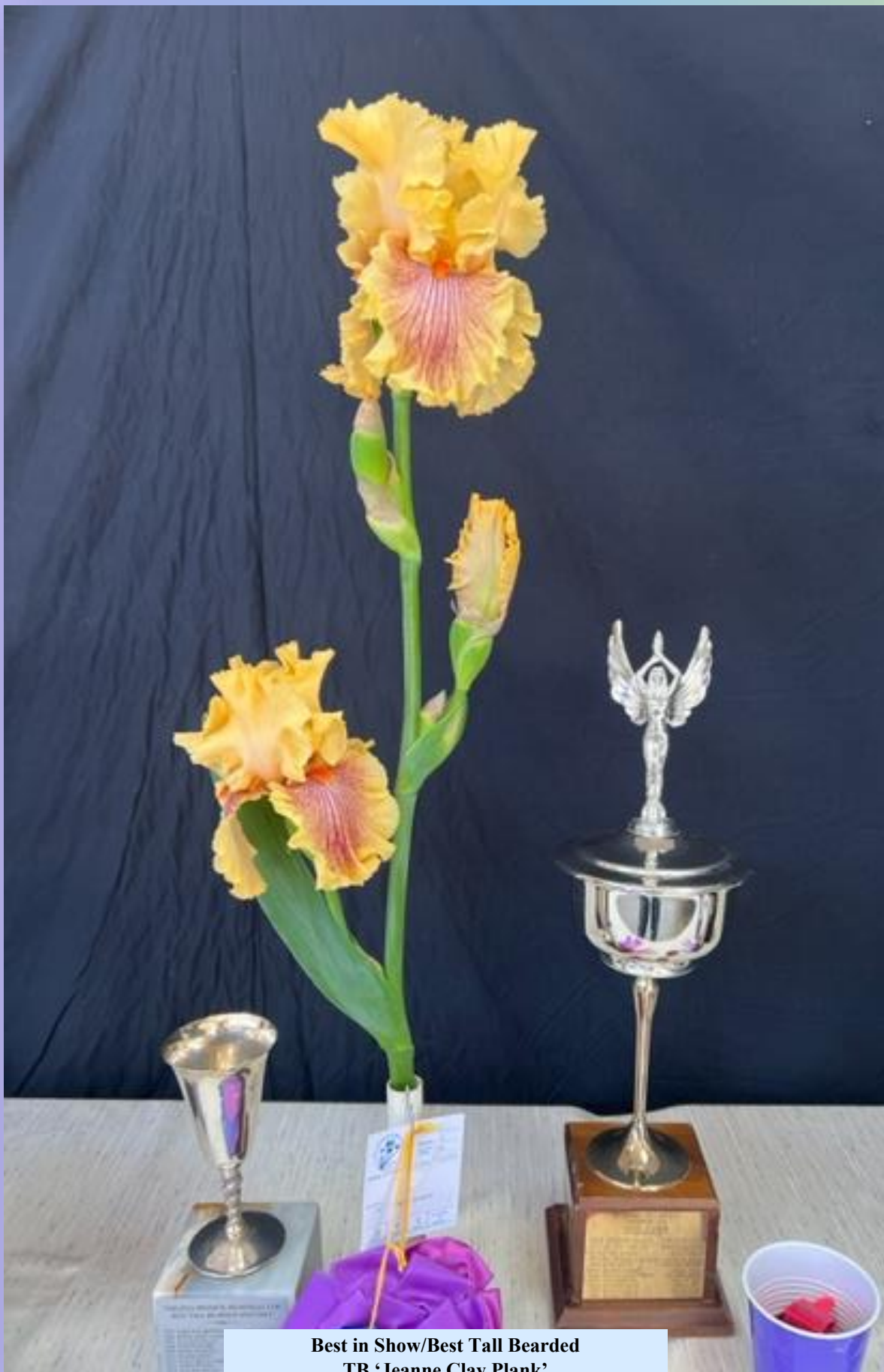
Best in Show/Best Tall Bearded TB 'Jeanne Clay Plank'