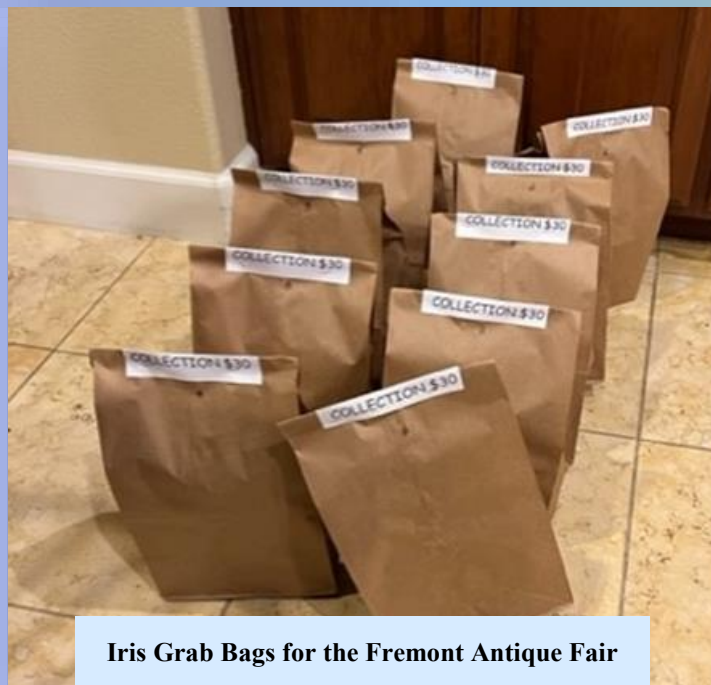
Iris Grab Bags for the Fremont Antique Fair