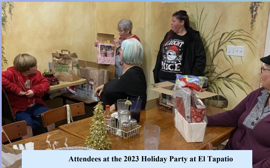
Attendees at the 2023 Holiday Party at El Tapatio

December’s Christmas Party was held at El Tapatio in Porterville. It was a new venue and everyone agreed to continue having it at El Tapatio in the future.