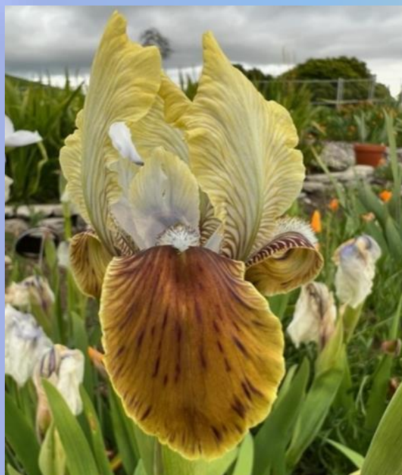
'Turkish Topaz' Lloyd Austin, 1962, Aril Hybrid