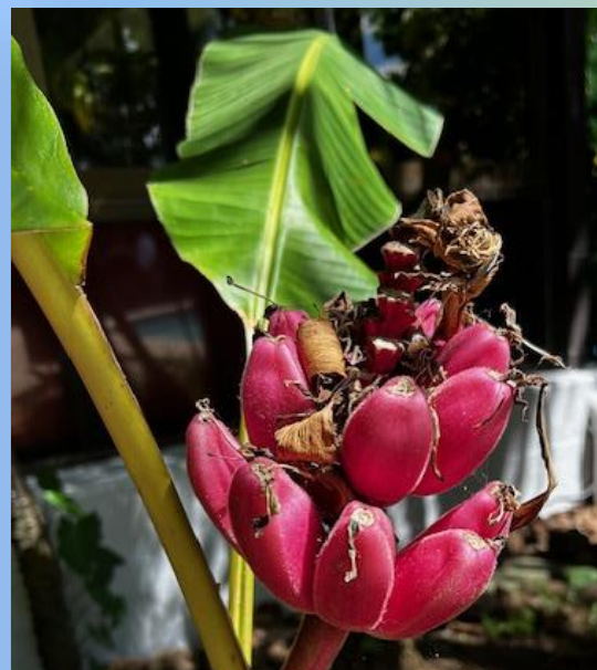
'Musa velutina' Pink Hairy Banana Costa Rica

Members who do not have access to a computer may ask the Editor for a printed copy at no charge.