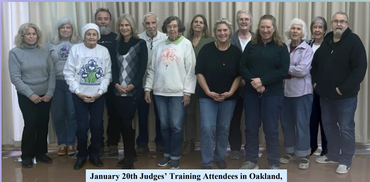
January 20th Judges' Training Attendees in Oakland, CA