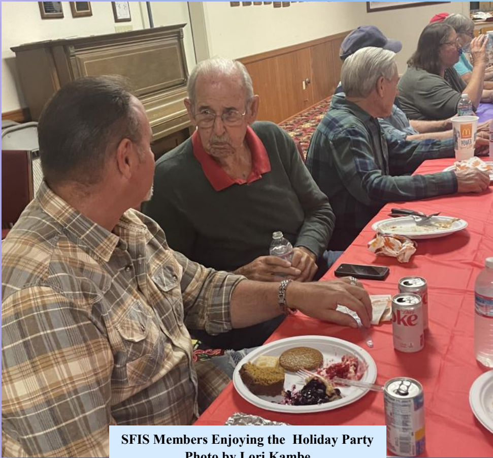
SFIS Members Enjoying the Holiday Party