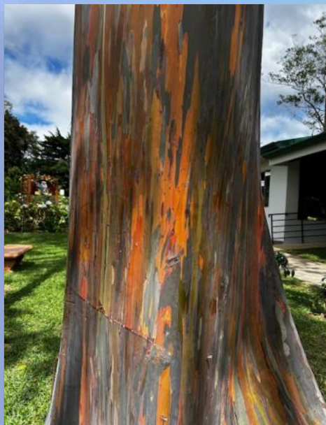
Eucalyptus 'Rainbow' Deglupta Costa Rica