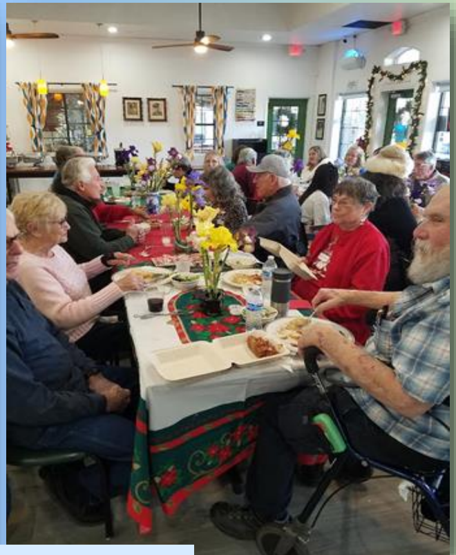
YIS Members Enjoying the Christmas Party