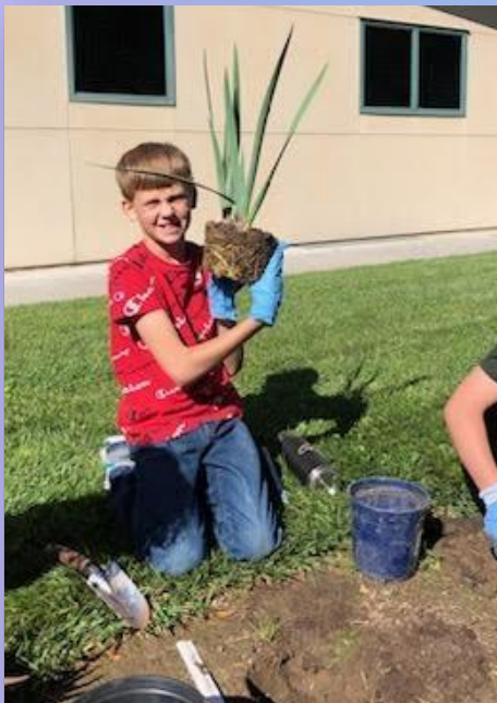
Oakhurst School 5th Grade CIP Youth Member