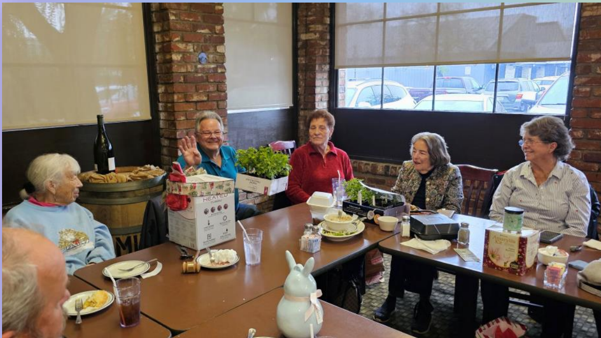
Fresno Iris Society Members Enjoying the Holiday Party & Gift Exchange