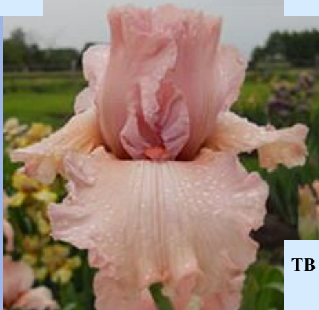
TB 'Evelyn Condo' (Timothy Metler, R. 2013)