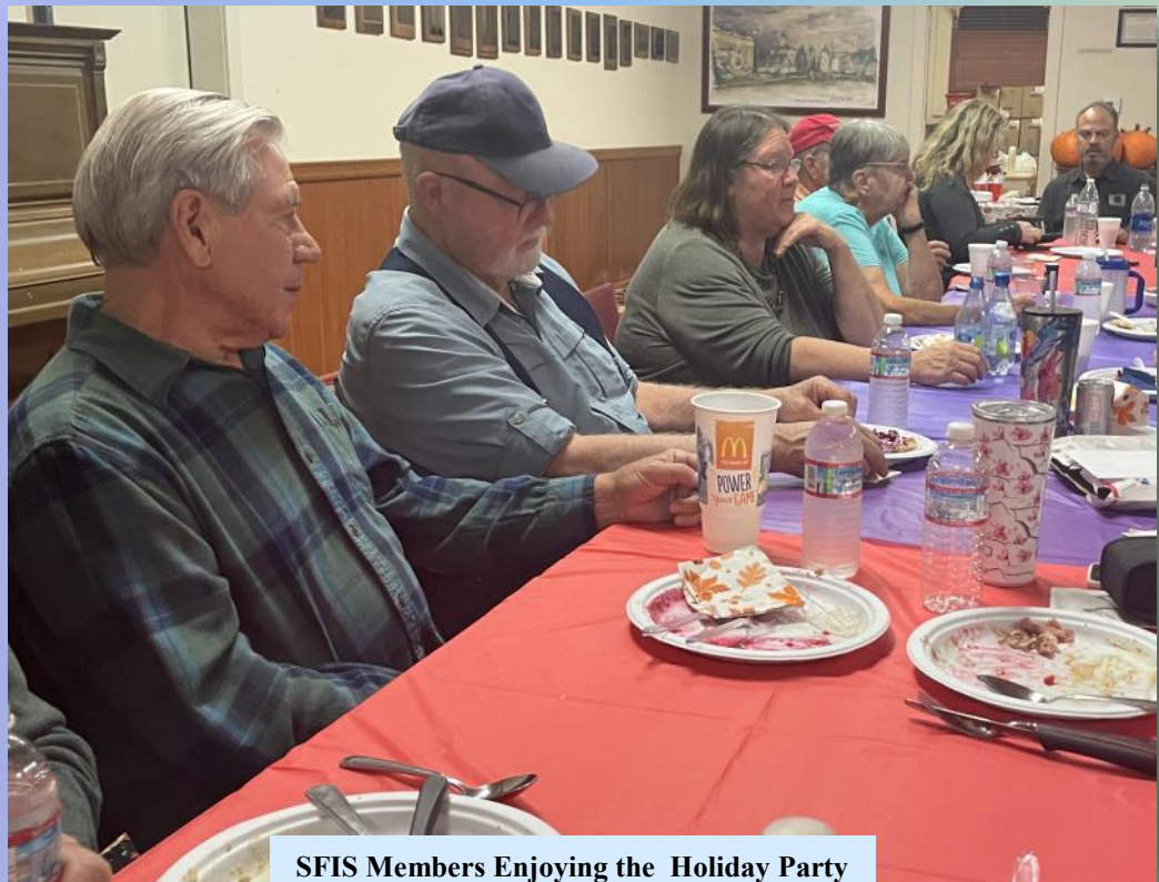
SFIS Members Enjoying the Holiday Party