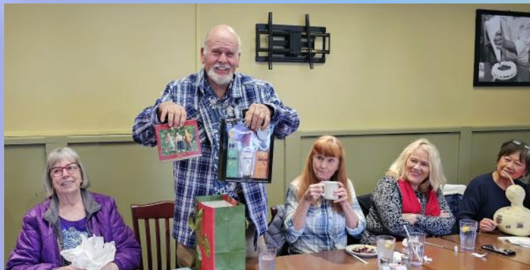
Fresno Iris Society Members Enjoying the Holiday Party & Gift Exchange

The Fresno Iris Society held its annual Christmas party at Marie Callender’s on January 13th, 2024. There are several reasons it is held in January, primarily to avoid the chaos of the Christmas season in December and to avoid the fog which is prevalent in our area. After our lunch, we have a white elephant gift exchange which is enjoyed by all members.