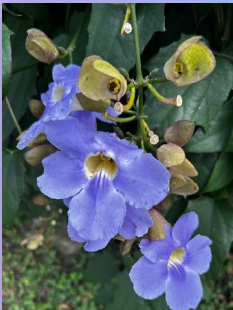
Thunbergia Grandiflora, 'Clockvine' Costa Rica