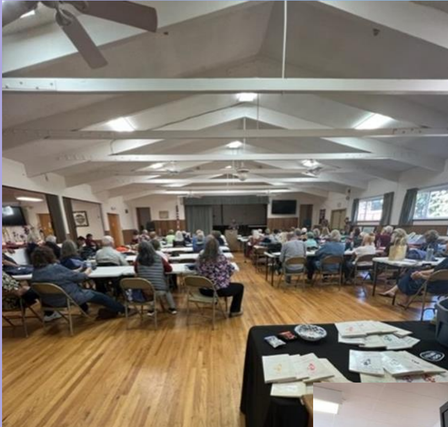
2023 Fall Regional Meeting Aptos, CA

The Fall 2023 Regional was held in Aptos, CA, and hosted by the Monterey Bay Iris Society. Many thanks to the dedicated team of MBIS members who made this happen!