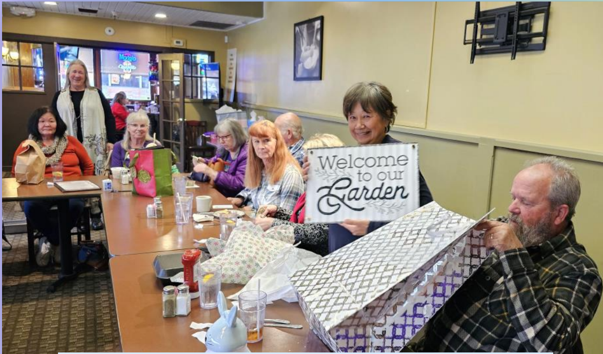
Fresno Iris Society Members Enjoying the Holiday Party & Gift Exchange