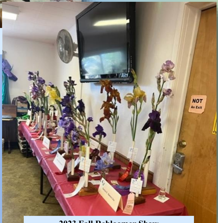
2023 Fall Rebloomer Show R14 Fall Regional Aptos, CA